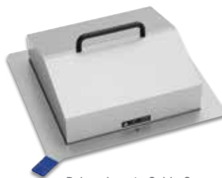
Polycarbonate Gable Cover