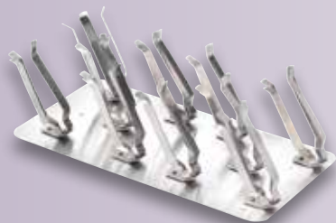
Test Tube Tray