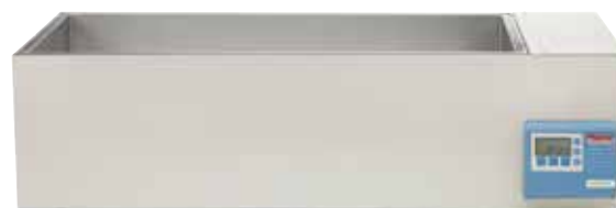
CIR 89 Water Bath